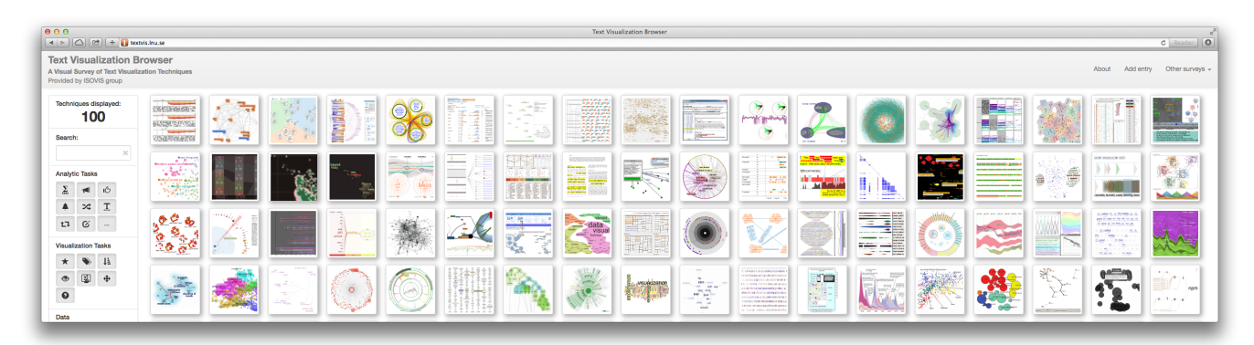
Figure 1: The web-based user interface of our visual survey. By using the interaction panel on the left hand side, researchers can look for specific visualization techniques and filter out entries with respect to a set of categories (cf. the taxonomy given in Sect. 2). Details for a selected entry are shown by clicking on a thumbnail image in the main view. The survey contains 100 categorized visualization techniques by June 24, 2014.

ISOVIS Group, Department of Computer Science, Linnaeus University, Växjö, Sweden