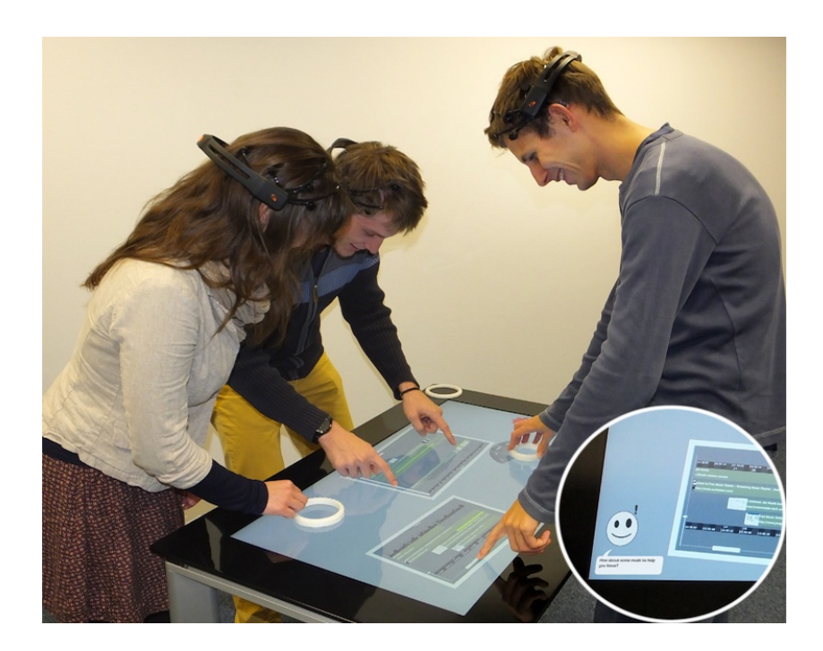
Fig. 3. Users collaborating around a tabletop application while wearing BCI devices that interpret their affective states. The GAT virtual agent inspects these affective states and offers real-time feedback about the group affective tone, as well as suggestions for developing a PGAT.

The results of our study are highlighted in Figure 4. They suggest that employing a virtual agent for offering feedback about the GAT can significantly reduce the average task completion time by up to 26%. Further, the average times spent by each group without a GAT or in a NGAT present a drop in the two cases where the Pogat agent was used. Additionally, although the completion times are similar in the last two cases, it seems that employing an agent capable of offering concrete suggestions towards regulating the GAT improves the amount of time spent by a group in a no-GAT state, and increases the period of experienced PGAT.