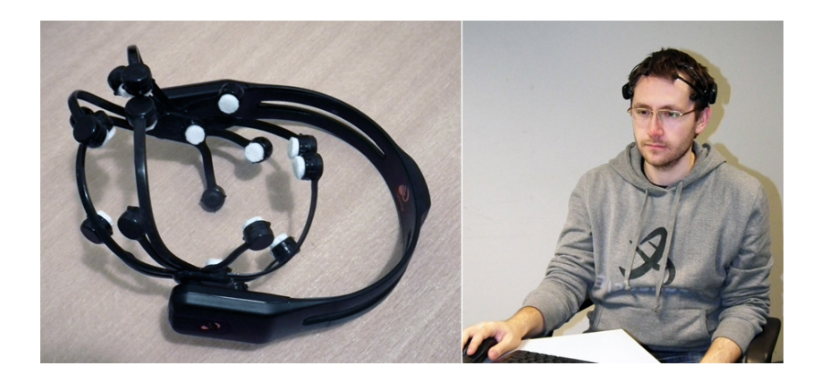
Fig. 1. Image of the Emotiv EEG neuroheadset (left). User wearing the EEG device while interacting with a computer (right).