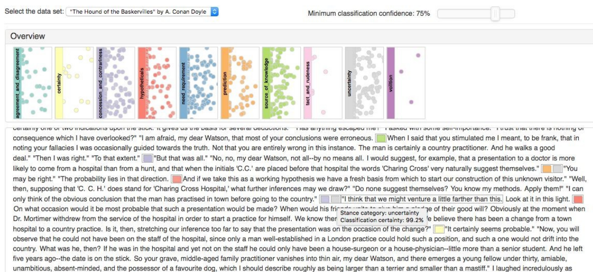
Figure 2: A prototype visualization of stance classification results for literature.

We also demonstrate how visual stance analysis could be practically applied to literature studies by combining the automatic stance classifier with text visualization principles (Kucher & Kerren, 2015). Our prototype depicted in Figure 2 provides an overview of stance classification results for a fiction text (divided into utterances). The overview consists of scatter plots for individual stance categories, resembling the document overview in uVSAT (Kucher et al., 2016). Each positively classified utterance is represented by a dot marker in the corresponding plot, and its position in text is mapped to the dot's position. The overview supports details on demand and navigation over the text. The prototype also provides a detailed text view with stance category labels and details on demand, thus supporting both distant and close reading approaches (Jänicke, Franzini, Faisal, & Scheuermann, 2015). Furthermore, classification confidence values reported by the classifier are mapped to the opacity of overview markers. They are also used for filtering to focus only on more reliable results. The prototype can be used to estimate the number of utterances with detected stance in a given text, compare the results for several stance categories, and explore the text in detail. With the stance classification accuracy improving over time, we believe such an approach could be useful for scholars in Digital Humanities.